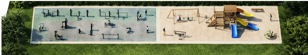
OUTDOOR CHILDREN'S PLAY AREA